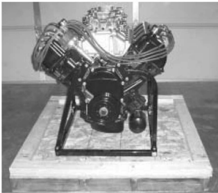
Engine on stand bolted to crate skid

2 nd Deposit: A second deposit of ½ of the cost of the engine must be sent to Indy Cylinder Head before any parts can be pulled. Indy Cylinder Head cannot accept credit cards for this payment of two reasons. First: Credit card fraud. Prevalent fraud throughout the credit card industry has forced ICH to set stipulation on the amount of money that can be put on a credit card transaction toward the purchase of a crate engine. Second: Due to ICH's minimum price margin on the Crate Engine Program the additional percentages taken by the credit card companies would not sustain the low price margin. The funds can be sent in by: