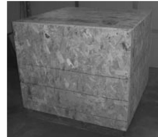
External view of 1/2" plywood crate. 2x4 reinforced

Initial Deposit: An initial deposit of $1,000.00 maybe required to hold a block. This can be put on a credit card (MC, Visa and Discover are accepted). When using a credit card the correct billing name (name as it appears on the credit card) and billing address (the address that is associated with the credit card) must accompany credit card deposits.