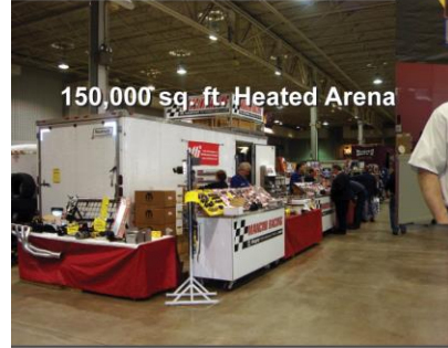
150,000 sq. ft. Heated Arena

Buy, Sell, or Trade Parts in the World's Largest Swap Meet!